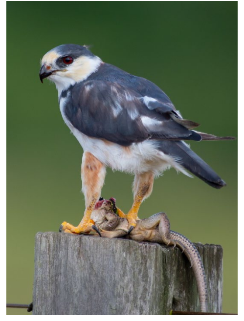
Pearl Kite

The Covid-19 pandemic has substantially affected the travel industry, and travelers rightfully have concerns. The safety of our trip participants is our highest priority. We have created a