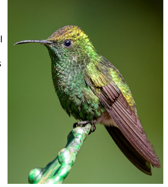
Coppery-headed Emerald

Overnight: Hotel Montaña Monteverde (5,000 ft)