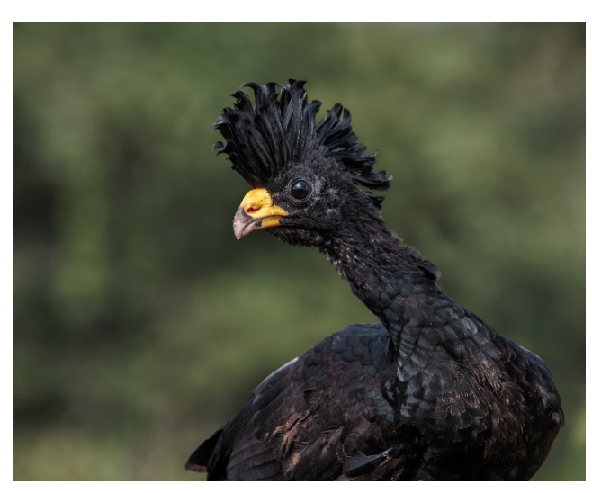
Great Curassow

Overnight: La Selva Biological Station (150 ft)