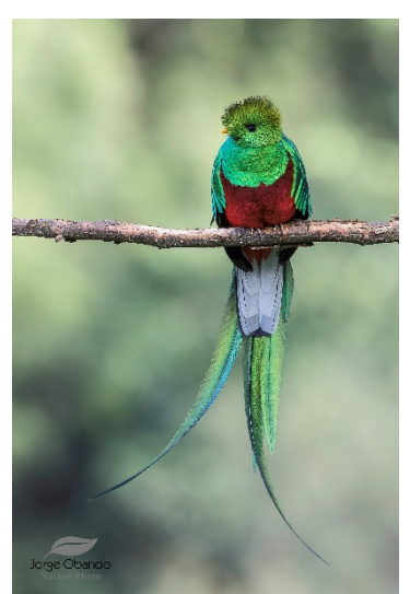
Resplendent Quetzal

Overnight: Sueños del Bosque Lodge (7,200 ft)