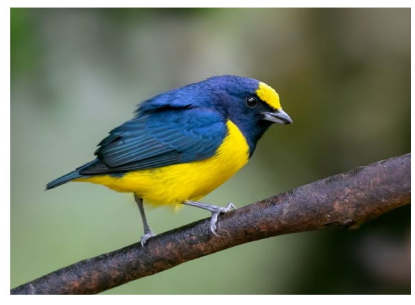
Spot-crowned Euphonia

Cost is based on double occupancy. Single rooms may be available for an additional cost of $200. A $100 per person deposit is required to reserve your space on this extension. This deposit is refundable until February 17, 2022 at which time final payment is due.