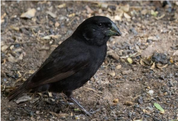
Large Ground-Finch

tortoises can be spotted in their natural habitat amongst the bushes. Land iguanas nest in the middle of the trail, where their distinctly textured and yellowish skin can be observed from up close. Flycatchers, Darwin's finches, and Galápagos Mockingbirds are commonly seen in the area. Room type – Cabin