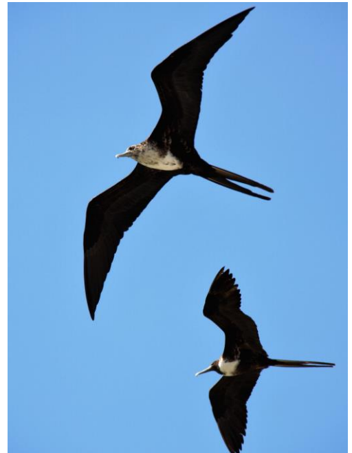
Magnificent Frigatebirds

Today, travel to the airport for your flight home. Check out is at 12 pm.