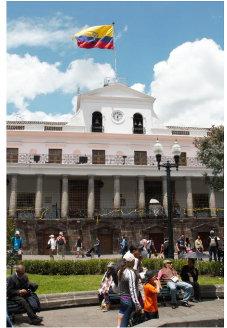
Presidential Palace, Quito